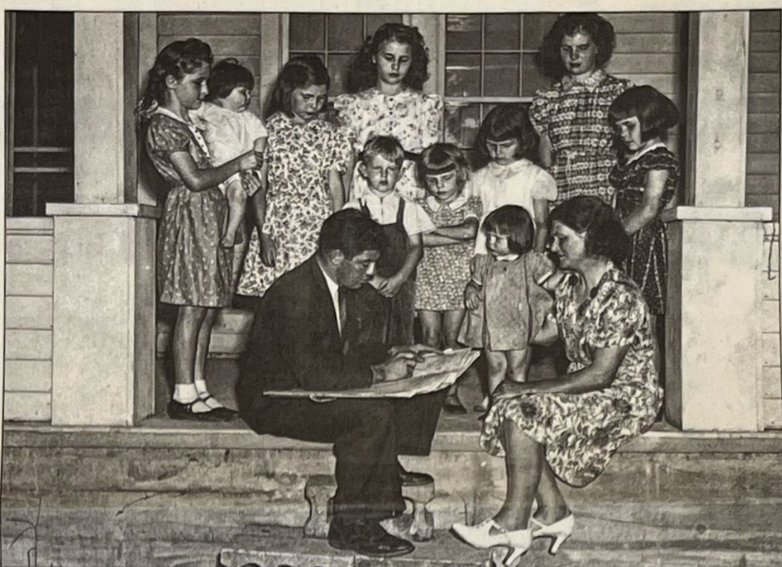
An enumerator interviews a woman for the 1940 Census. Veiled in secrecy for 72 years because of privacy protections, the 1940 U.S. Census is the first historical federal decennial survey to be made available on the Internet initially rather than on microfilm.

In part because of the need to overcome a growing reluctance by the American public