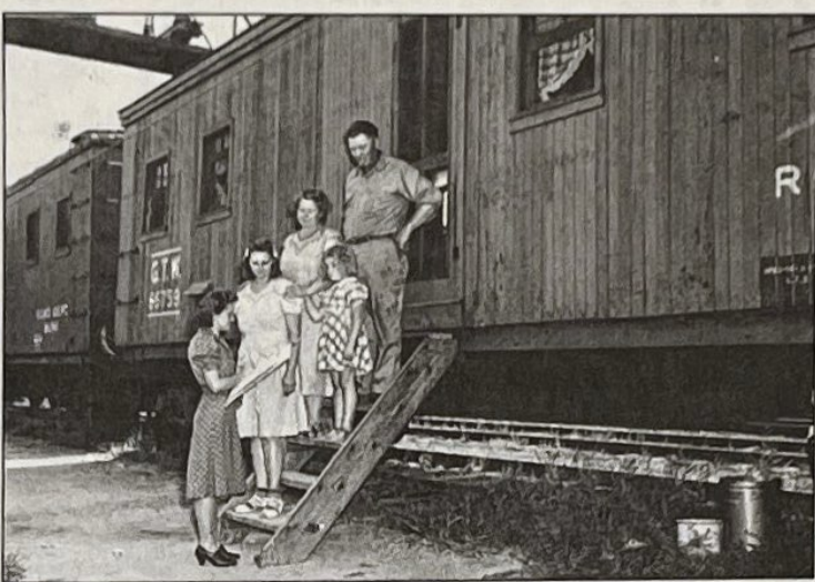
An enumerator, left, interviews a family outside a rail car for the 1940 Census.