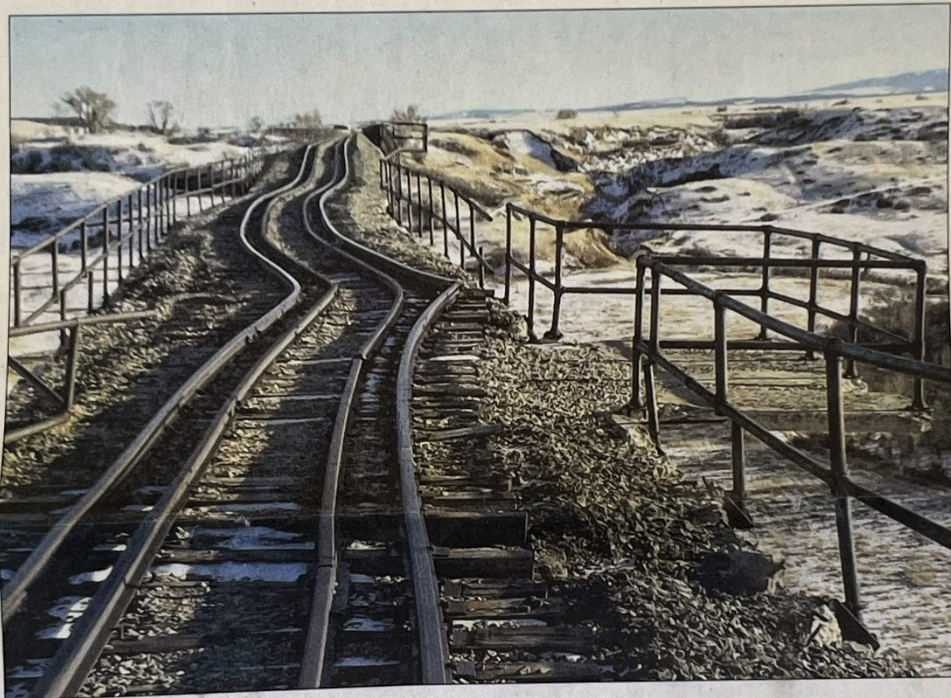
Once ruler-straight, the tracks across the Judith River Trestle now bend and sag due to damage caused by last spring's floods.