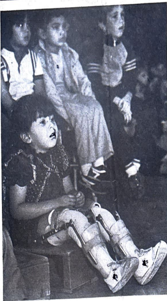
By Jeff Kruger Star Staff Writer

BREA — A tale of two cities, one is relatively affluent, with good medical care and education provided to its residents. The other is poor and agrarian, with hospitals and schools measuring up to U.S. standards of days gone by.