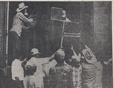
Eager hands unload a warming oven donated by the Brea Rotary to the Rafael Larios Hospital in Lagos de Moreno, Mexico.

Other items given to the hospital include 30 mattresses and nightstands, 38 overbed tables, two gurneys, three wheelchairs, five cribs and many other items