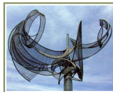
Exhibit sponsored by Aera Energy